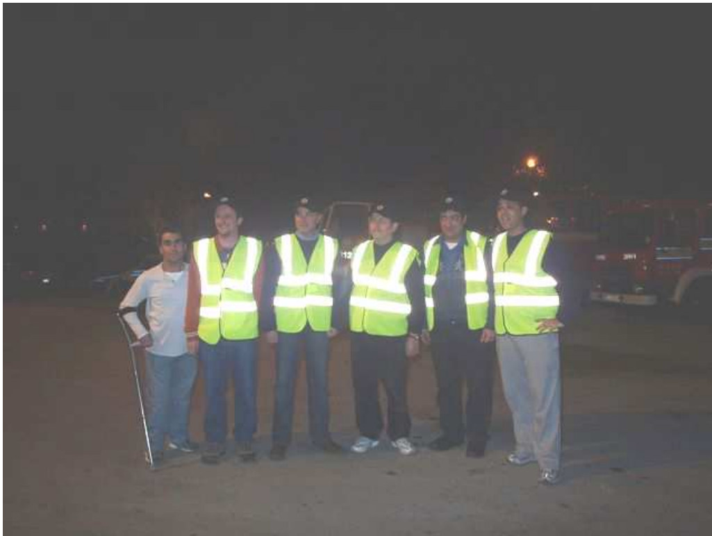
9H1SF, 9H1PI, 9H1AA, 9H1VW, 9H1M, 9H1PS

There was also a presentation on a monitor by 9H1M about civil protection activities in other countries that also served as information of similar activities and how these are carried out outside Malta.