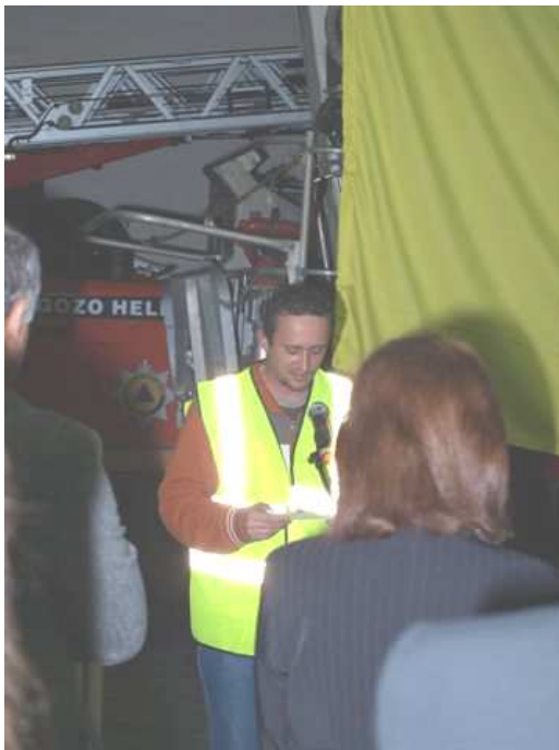
9H1PI reading a prayer