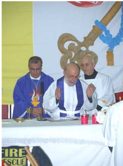
Mons Archbishop at the back

We hope that more radio amateurs will be enticed to offer their services later when things will have moved forward and we hope to have a group in every town and city in Malta that will be ready to offer their services if the need arises.