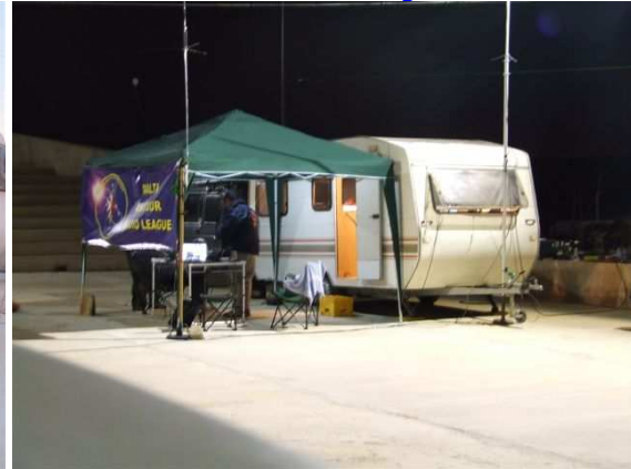
9H1SF 9H5OU 9H1PI 9H1BW 9H1VW 9H1AA